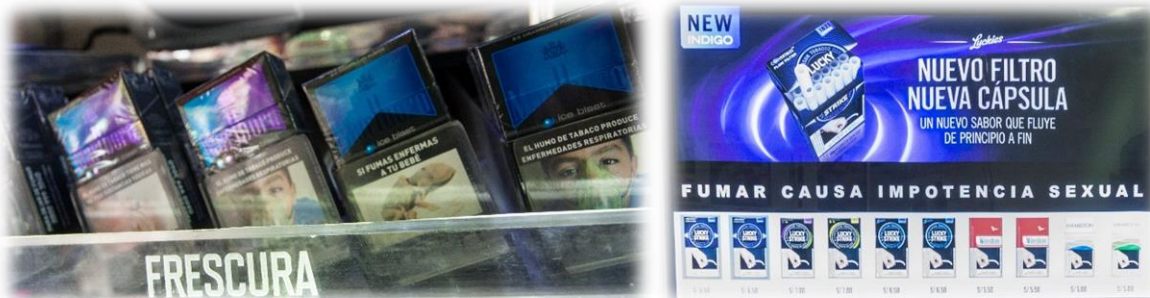
Cigarettes with flavor capsules on display and advertised at a POS in Rio de Janeiro, Brazil