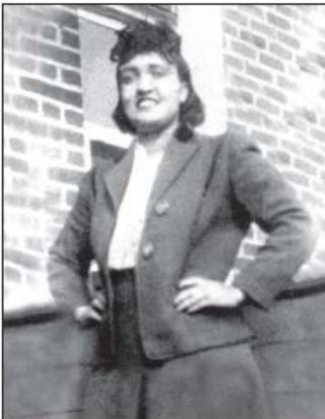
Photo of Henrietta Lacks

In 1951, Henrietta Lacks, a black woman, died of cervical cancer even after receiving treatments that were the standard of care at that time. Physicians successfully cultivated her cancer cells and the result was used for the last 65 years as a major culture medium used in medicine. The family was only informed years later. 13