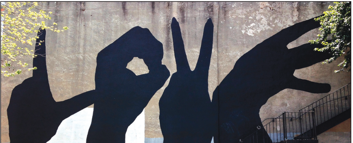
One of 20 love walls around Baltimore, Maryland, part of the Baltimore Love Project. This is in southwest Baltimore near Hollins Street Market.